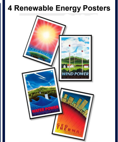
4 Renewable Energy Posters