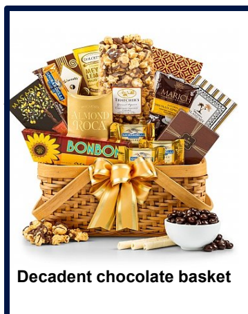
Decadent chocolate basket