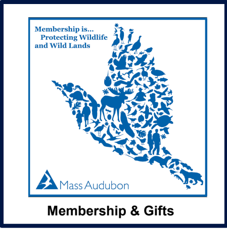
Membership & Gifts