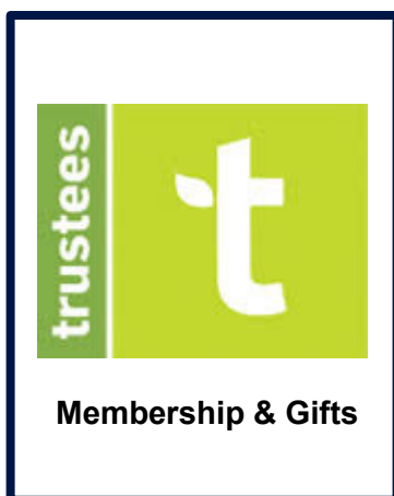
Membership & Gifts