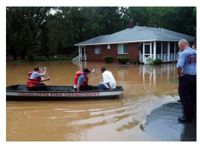
Flooding in Charlotte, NC after heavy rain in 2011.

"Since 1999, Storm Water Services has purchased over 400 flood-prone houses, apartment buildings and businesses that were in floodplains throughout Charlotte-Mecklenburg. Over 700 families and businesses have moved to less vulnerable locations